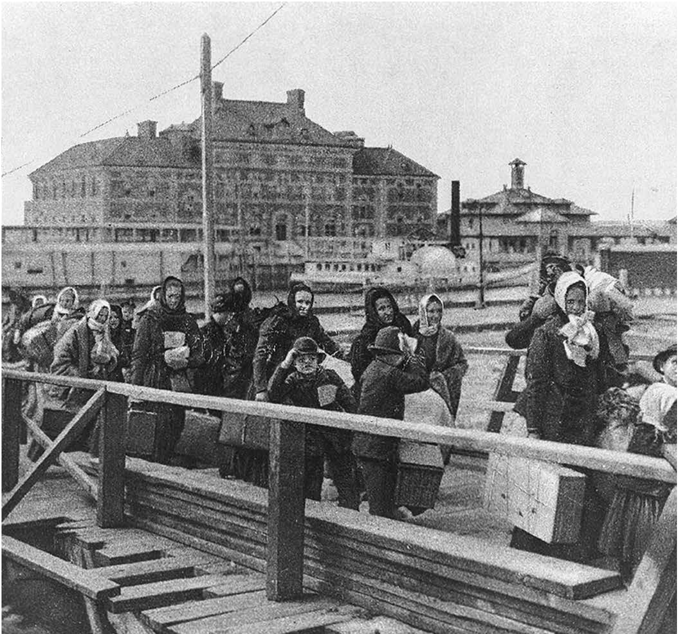
Immigrants arrive at Ellis Island in 1902.

The United States began as a colony of the British Empire, gaining independence in 1776. Over its history, many immigrants have settled in the U.S. It has become known as a “melting pot” of different peoples. God prophesied that the descendants of Israel would be sifted like grain “among all nations” (Amos 9:9). Most of Manasseh’s descendants came to Britain along with Ephraim, but some were scattered throughout other nations, then immigrated to America.