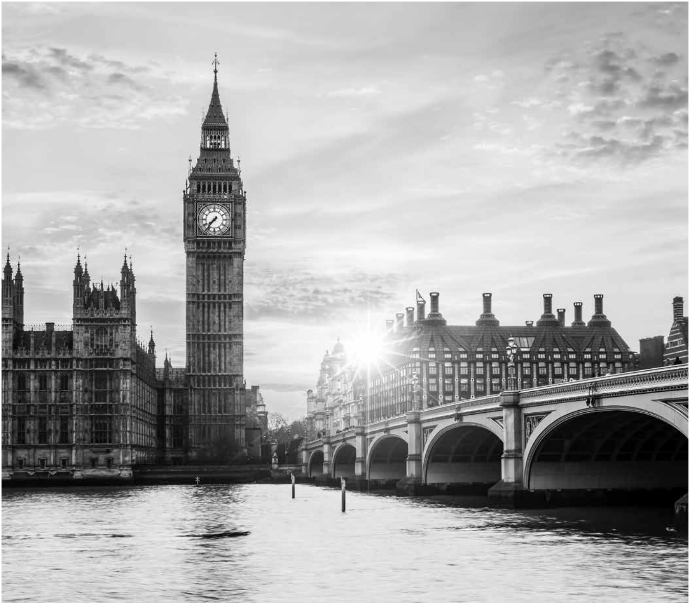
The descendants of Ephraim became the British peoples.

daughter and his assistant, Baruch. Their final destination was the islands of the United Kingdom.