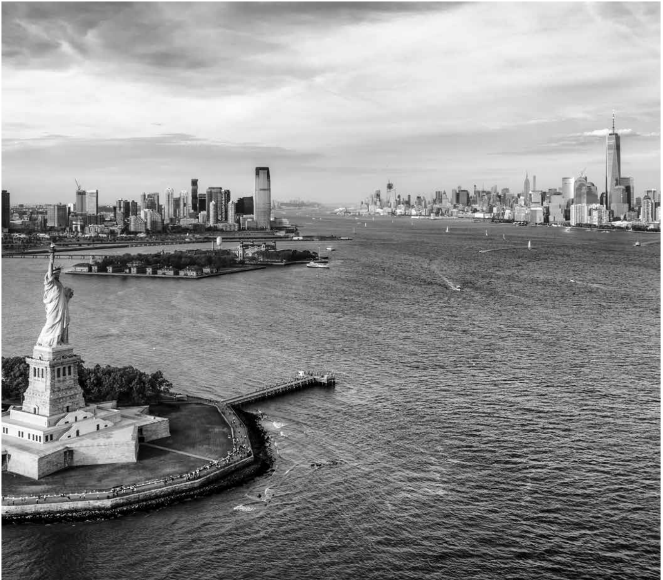
The descendants of Manasseh became the nation of America.

enemies,” including important and strategic ports, canals, straits, capes and seaways (Genesis 22:17). It ruled a quarter of the entire population of the planet.