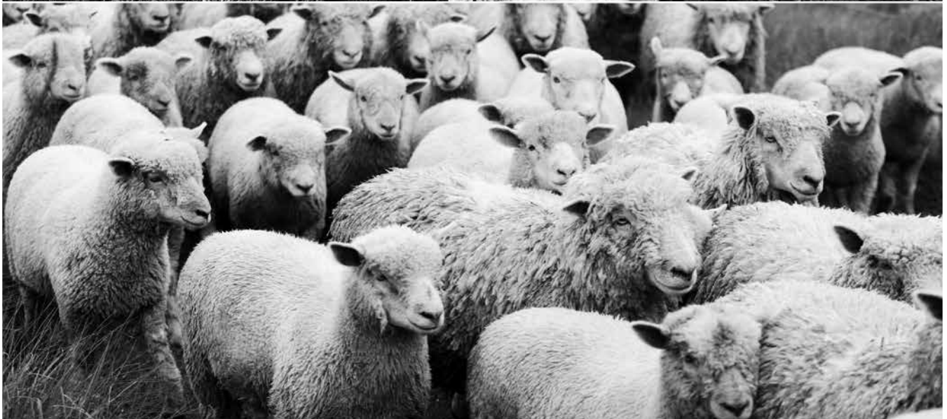
God promised blessings to the descendants of Abraham, including abundant crops, sea lanes like the Strait of Gibraltar, and massive livestock herds.